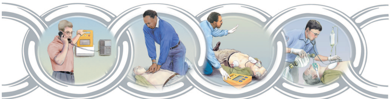
Figure 1. Adult Chain of Survival.

Stroke is the nation's No. 3 killer and a leading cause of severe, long-term disability. 61 Fibrinolytic therapy administered within the first hours of the onset of symptoms limits neurologic injury and improves outcome in selected patients with acute ischemic stroke. 76–78 The window of opportunity is extremely limited, however. Effective therapy requires early